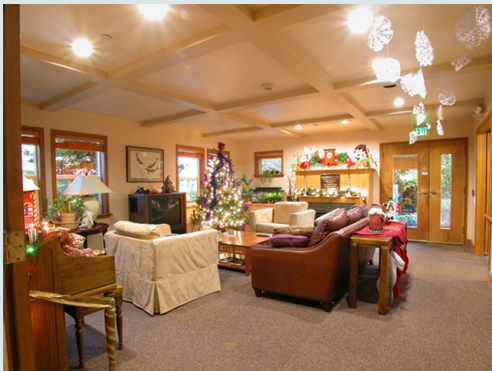
Pictured: A sitting-room or lobby with a Christmas tree and decorations.