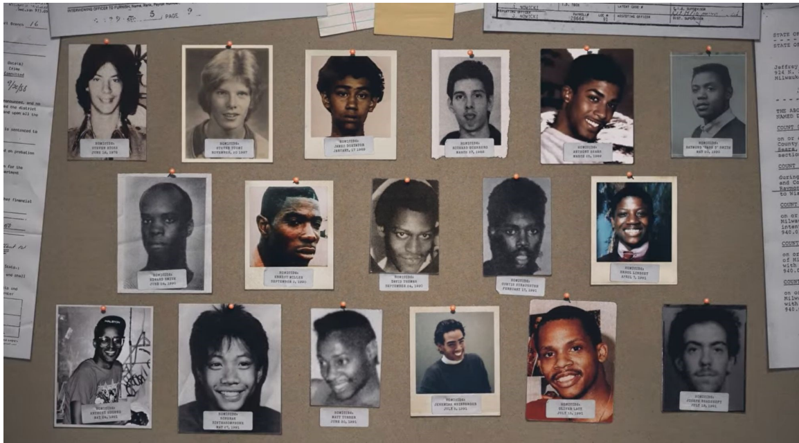
Images of the victims

The Netflix series Monster dramatized the real-life murders of Black and Brown men and boys in Milwaukee from 1988 until 1991, which made me wonder how close the gay community was at the time of the killing spree, and if this same thing could happen again in 2022.