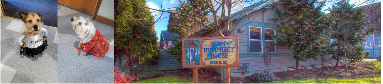
Pictured: Spoiled house dogs, Daisy & Sitka wearing Halloween costumes, and the exterior of Sean Humphrey House.