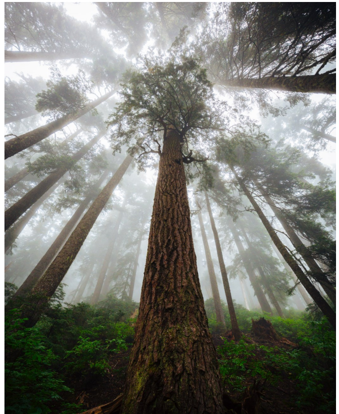
Image of trees in rural Southwest Washington, courtesy of Dave Hoefler, Unsplash. free images

CAP offers walk-in rapid HIV and HCV testing in its Longview location (1338 Commerce Ave, Suite 204) on Wednesdays from noon to 5 p.m. For alternate times or to request an at-home test kit, please call or text Beau Finan at 360.363.0510. Other CAP testing locations and times can be found at the CAP Know Your Status Website ( https://www.capnw.org/get-tested ).