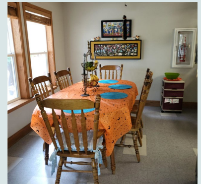
Pictured: A dining-table with bright orange table cloth and bright blue table mats.