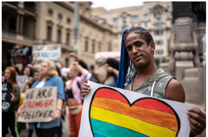
Transgender woman holding a sign during a demonstration in the street

Depending on where a transwoman lives, she deals with stigma, constant fear for her safety, housing discrimination, securing employment, being fired from a job if she is outed for her trans-identity, rejection in relationships, and sometimes enduring physical, verbal, and emotional abuse to maintain a relationship. Transwomen dating men who are fully aware of their transition are usually not ok with others knowing. Men dating transwomen also deal with stigma, being ostracized by family and friends who find out, and fear for their safety.