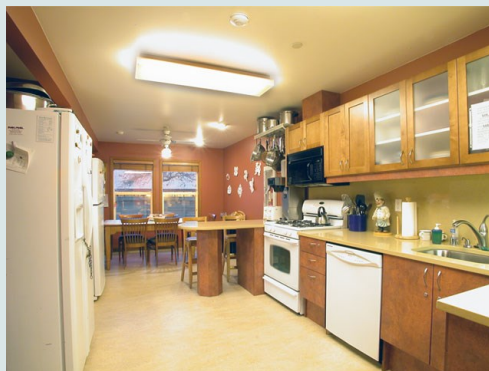
Pictured: Bright yellow kitchen with white appliances leading to a dining area.