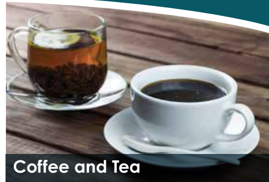
Coffee and Tea