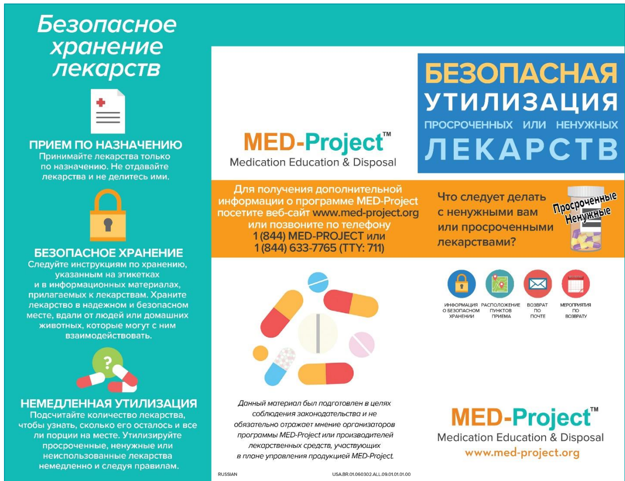
Figure 7: MED-Project Brochure Front (Russian)