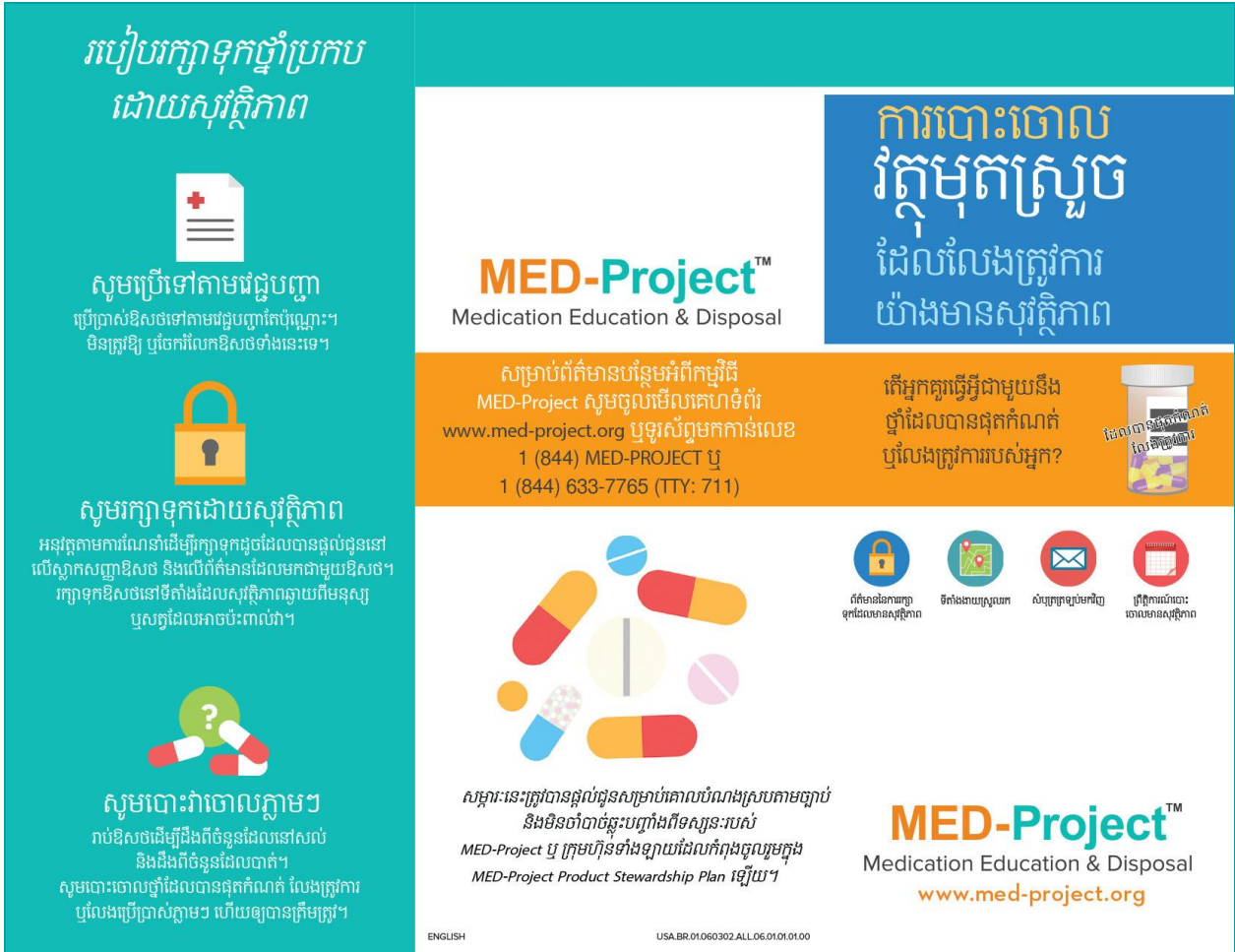
Figure 13: MED-Project Brochure Front (Khmer)