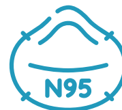
A mask or respirator (e.g. N95).