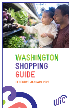
NEW SHOPPING GUIDE

Please use this guide to learn more about the updates to our WIC approved foods.