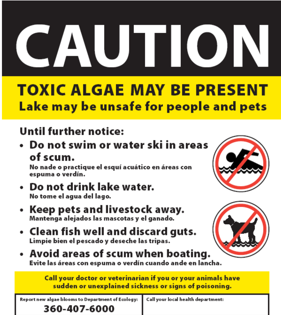
Figure A1. Caution sign for use in Tier 1.

For more information: www.doh.wa.gov/ehp/algae/ www.ecy.wa.gov/programs/wq/plants/algae/index.html