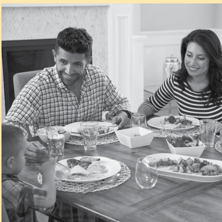
Ask me about my day during dinner!

Try to make meals family time. Plan to eat together at least once a day. Talk with your child about what they did during the day. Ask about their favorite part of the day.