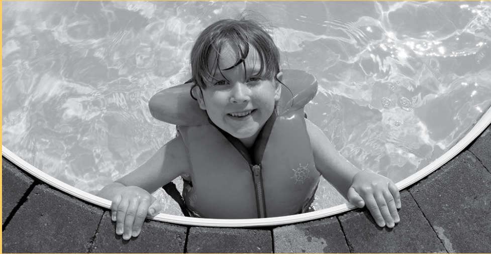
Make sure I wear a life jacket when I am in or near water.

For more information on water safety and drowning prevention for all ages visit seattlechildrens.org/dp .