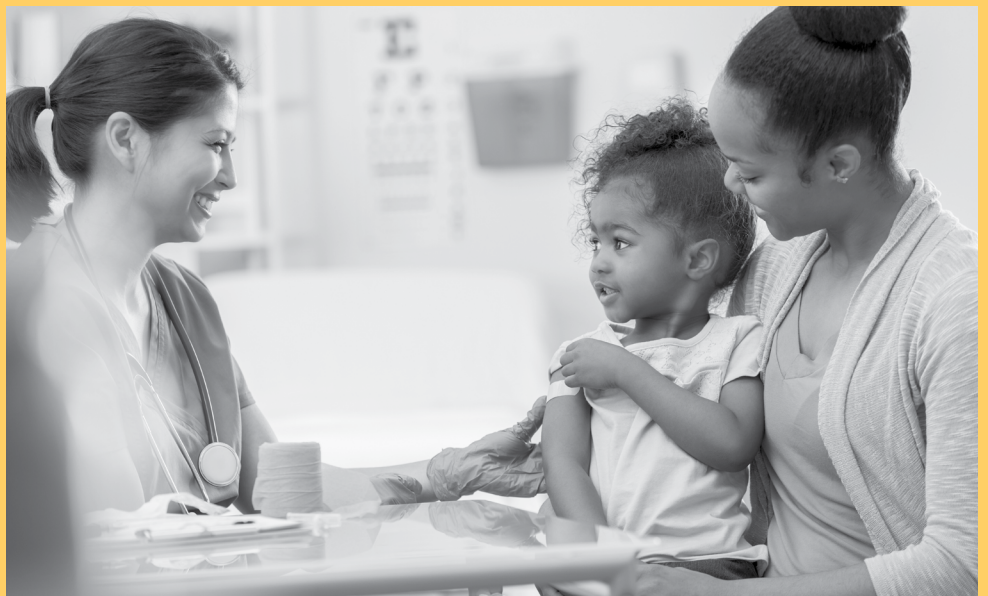
If you have questions about vaccines, ask my doctor.

Sign up to get access to your and/or your family's official immunization records online at myirmobile.com .