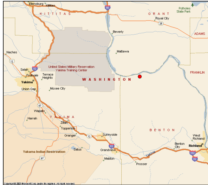
Fig. 1. McGee Ranch, which is indicated by the red dot near the center of the map

from the McGee Ranch Riverlands Area for QA purposes. These samples were collected and analyzed at the Public Health Laboratory in Shoreline, Washington.