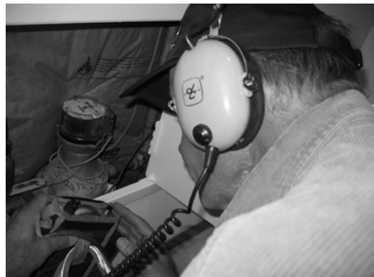
Good water management starts with regular and accurate meter reading.