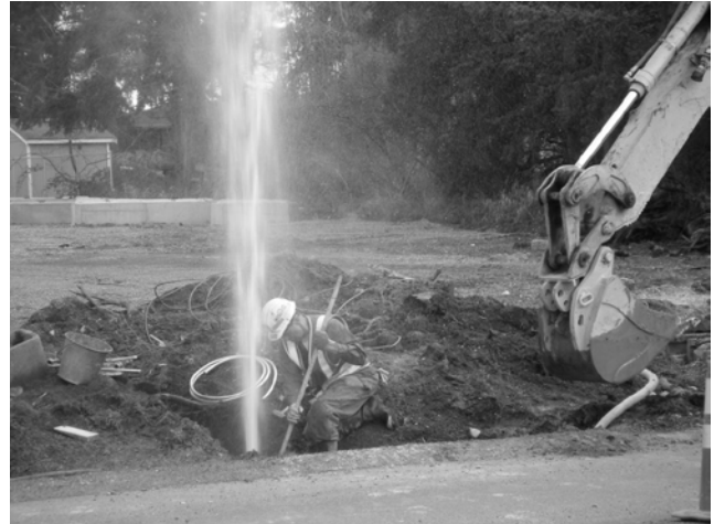
Chris Webster, a Tacoma Water utility worker, repairs a leaking distribution main.

One of the most important elements of the Department of Health's Water Use Efficiency Rule (rule) is a new distribution system leakage standard. The rule requires most water systems in the state to meet a leakage standard of 10 percent or less.